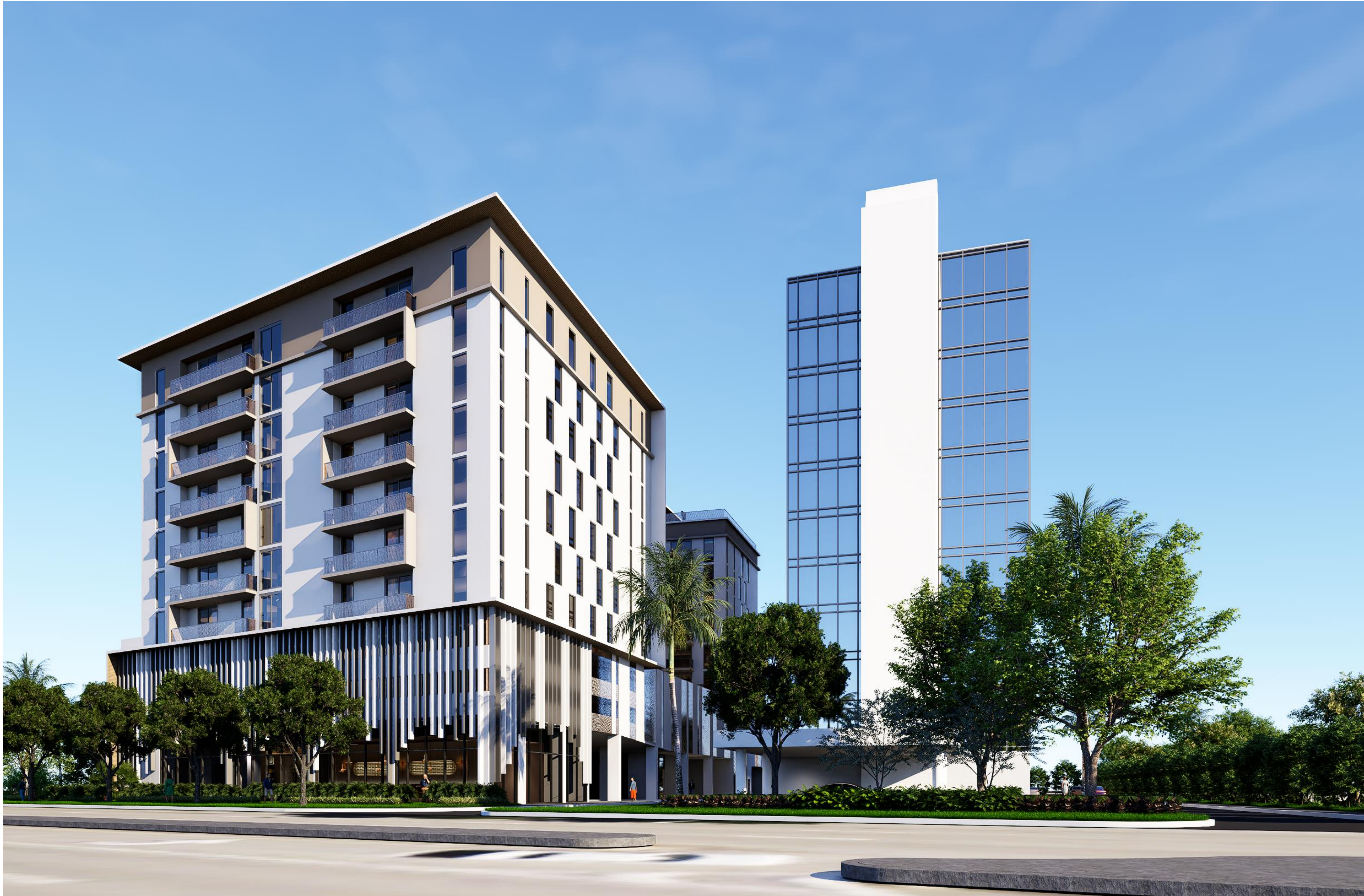
STREET VIEW OF THE SOUTH WEST CORNER OF THE BUILDING